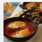
THURSDAY Eggs in Purgatory