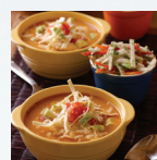
FRIDAY Chicken Tortilla Soup