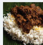
THURSDAY Beef Rendang