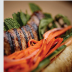
MONDAY Grilled Pork Banh Mi