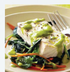
FRIDAY Steamed Fish with Lemon-Scallion Sauce