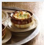
WEDNESDAY French Onion Soup