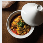
TUESDAY Chicken Thighs with Olives