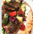
MONDAY Crispy Lamb Pita