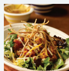
FRIDAY Taco Salad with Chicken